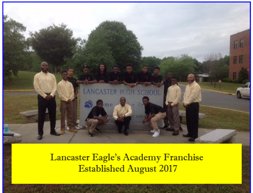
Lancaster Eagle's Academy Franchise Established August 2017

Sparking Hope. Igniting Optimism. Creating The Currents For A Brighter Future!